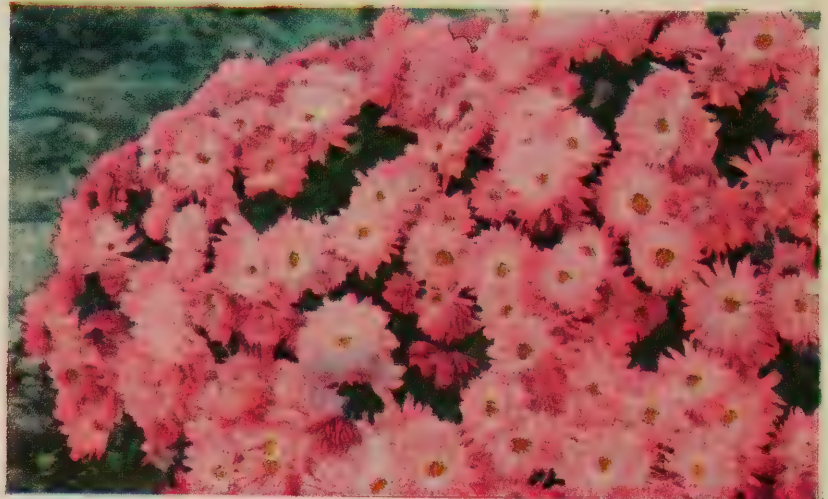
PINK CUSHION. 50c each; 3 for $1.25